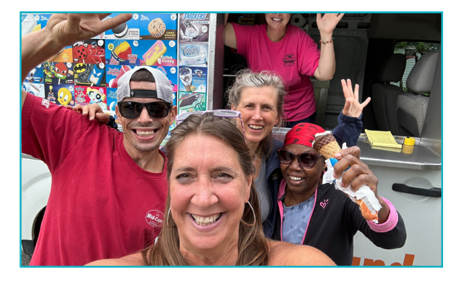
66 In the darkest time of the year, you are a shining light of positivity.